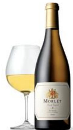
2009 Morlet Family Vineyards 'Ma Douce' Sonoma Coast Chardonnay ($70).